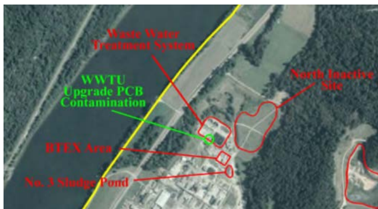
Figure 1: Partial Map of the Site (Dist. Ct. Dkt. No. 77-1 at 48)

Those processes created substantial PCB-laden chemical wastes. UCC disposed of that waste by burning it, or by depositing it into neutralization tanks or lime pits at the Site. After the lime pits filled with sludge, UCC drained them and dug them out, and used the PCB-laden sludge to backfill other areas of the Site. Some of the PCB-laden waste was deposited in the North Inactive Site, a 5.5 acre landfill located uphill and northwest of the Site's waste water treatment facility and a creek that runs through the Site, known as Sugar Camp Run. See Dist. Ct. Dkt. No. 77-1 at 48 (map of the Site); see also Dist. Ct. Dkt. No. 80-17 at 82-85 (ENVIRON Map of Site). The precise locations of all the backfill areas are unknown.